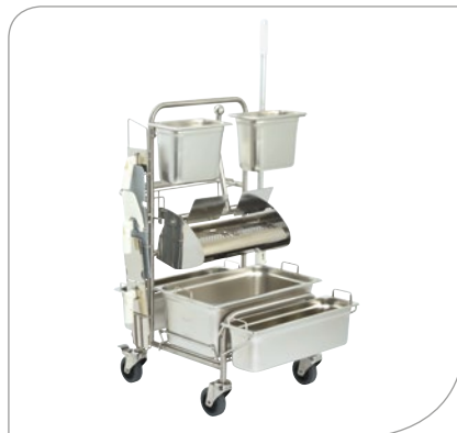
Cliно CR4 FP-GMP with accessories