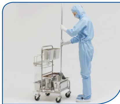
2 Attach mop in a contact-free manner and begin cleaning