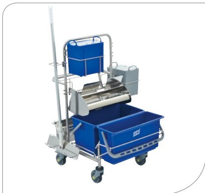
Cliно CR4 FP with accessories