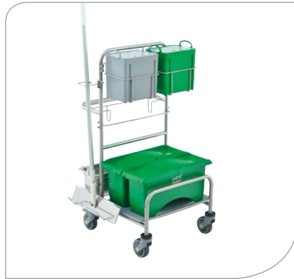
Cliно CR4 EM-CR with accessories Zone concept: Green