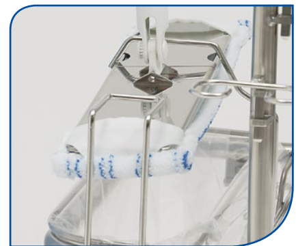
3 Contactless release of mop