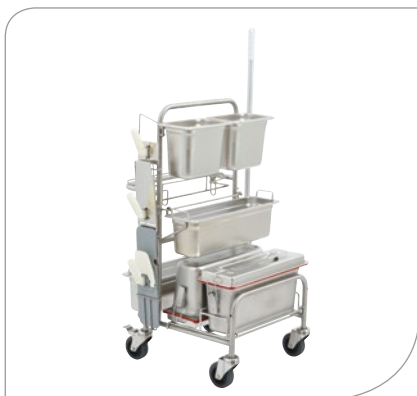
Cliно CR4 EM-GMP with accessories