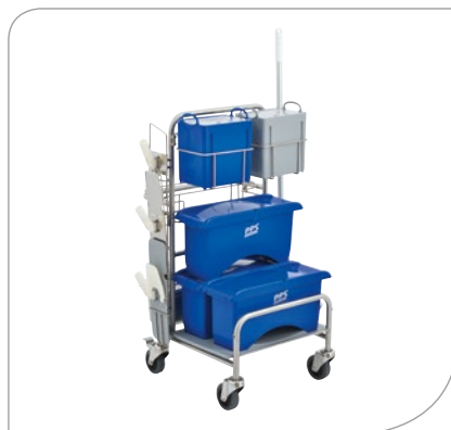
Cliно CR4 EM-CR with accessories Zone concept: Blue