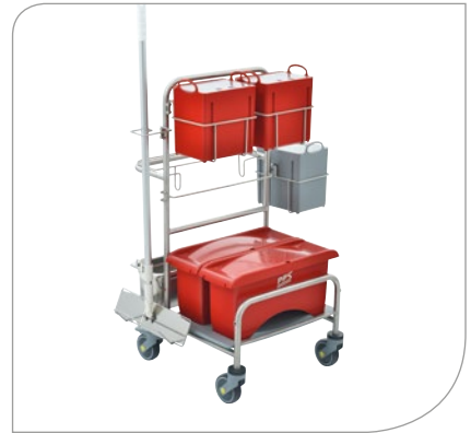
Cliно CR4 EM-CR with accessories Zone concept: Red