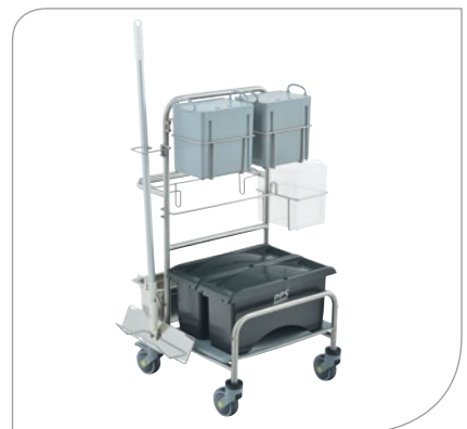
Cliно CR4 EM-CR with accessories Zone concept: Grey