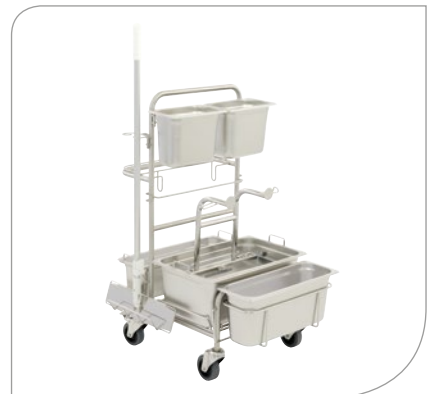
Cliно CR4 MF-GMP with accessories

With our service catalogue for effective contamination control, you can assemble your own individual system trolley design.