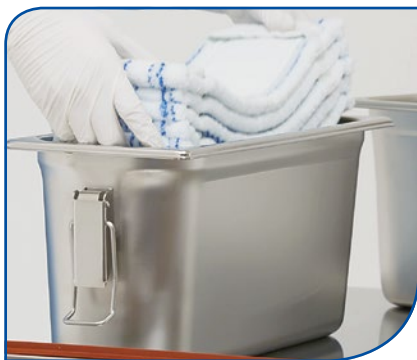
1 Properly dose cleaning product and place mop into system box