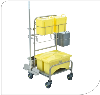
Cliно CR4 EM-CR with accessories Zone concept: Yellow