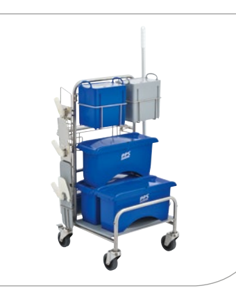
Clino CR4 EM-CR with accessories Zone concept: Blue