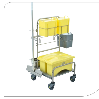
Clino CR4 EM-CR with accessories Zone concept: Yellow