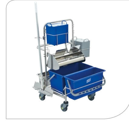
Clino CR4 FP with accessories