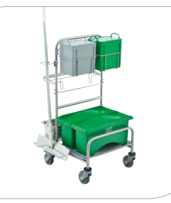
Clino CR4 EM-CR with accessories Zone concept: Green