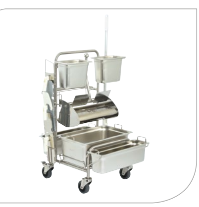
Clino CR4 FP-GMP with accessories