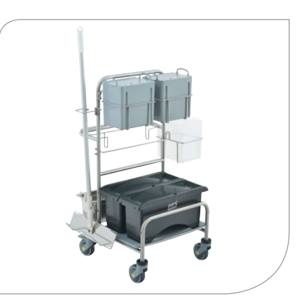
Clino CR4 EM-CR with accessories Zone concept: Grey