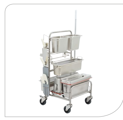
Clino CR4 EM-GMP with accessories