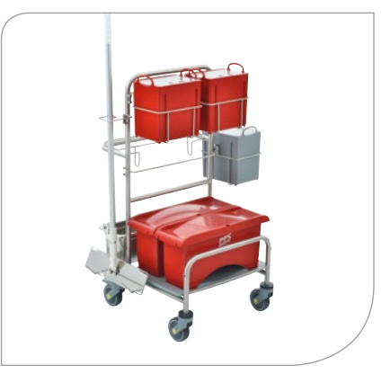
Clino CR4 EM-CR with accessories Zone concept: Red