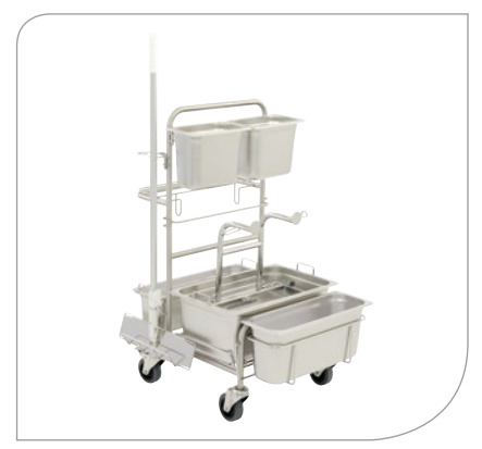
Clino CR4 MF-GMP with accessories

With our service catalogue for effective contamination control, you can assemble your own individual system trolley design.